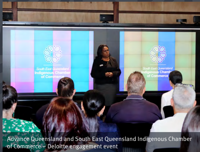
Advance Queensland and South East Queensland Indigenous Chamber of Commerce – Deloitte engagement event