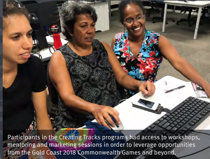
Participants in the Creating Tracks programs had access to workshops, mentoring and marketing sessions in order to leverage opportunities from the Gold Coast 2018 Commonwealth Games and beyond.

Create new innovative businesses led or managed by Indigenous businesses and innovators embracing technology and innovative practices where feasible.